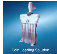
Coin Loading Solution